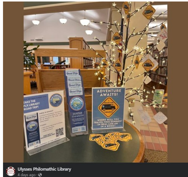
Like treats near the checkout, maps and Road Trip info are irresistible!